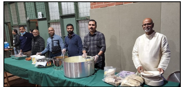
Celebrating after worship with shared meal