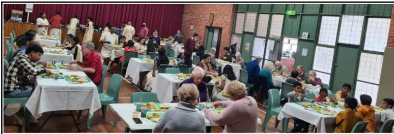
Left: During Onam, the traditional festival of the State of Kerala, the members of the congregation with the other parishioners, enjoying 'Onasadya', delicious home-made vegetarian cuisine of Kerala, on a banana leaf.