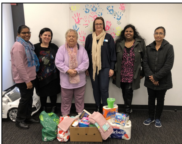
Above: Outreach organised by Women's Fellowship External Activity