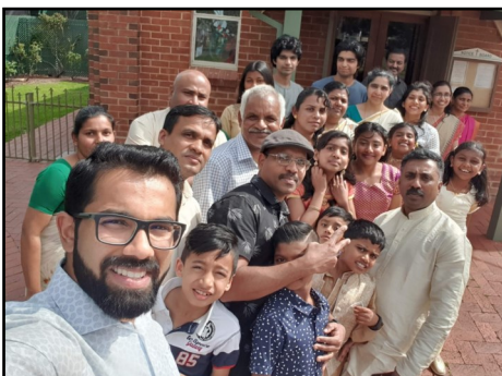
Left: A group selfie never fails to capture the happy faces