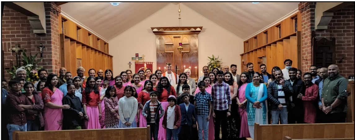
Thanksgiving Service at St Philip's

On May 15, 2022, the CSI Malayalam Congregation celebrated its 10th Church Day Anniversary with a service of Thanksgiving Worship and celebrations to follow.