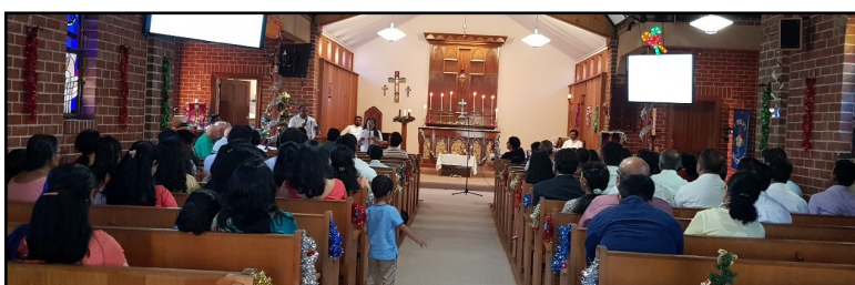
Left: "Let us come before Him with thanksgiving and extol Him with music and song."