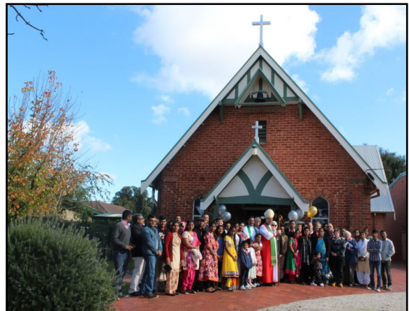
Celebrating the inaugural service at St Philips Church