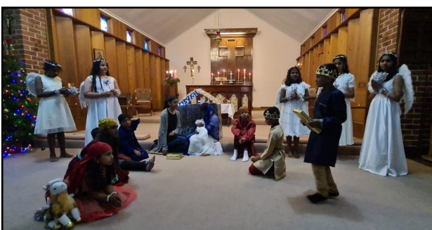
Above: Children performing the Nativity Show during Carol Nite