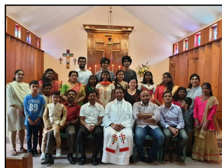
Right: Following Easter service in 2019