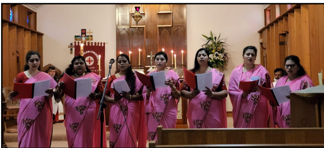
Women's Fellowship present special song