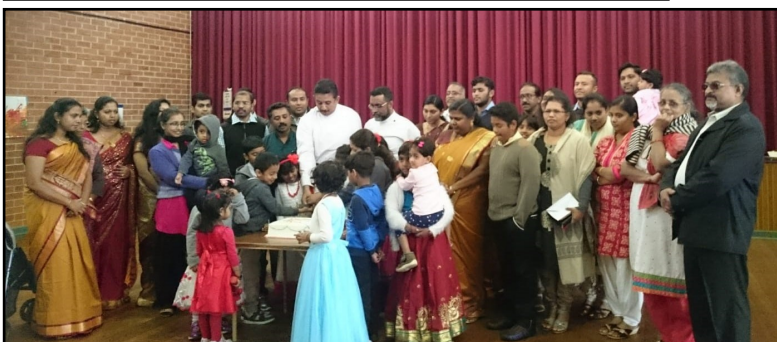
Below: Celebrating 5th Church Day by cutting the cake