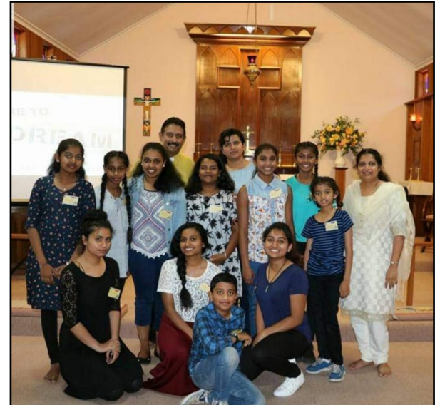
Youth from Melbourne CSI took the leadership to conduct the VBS