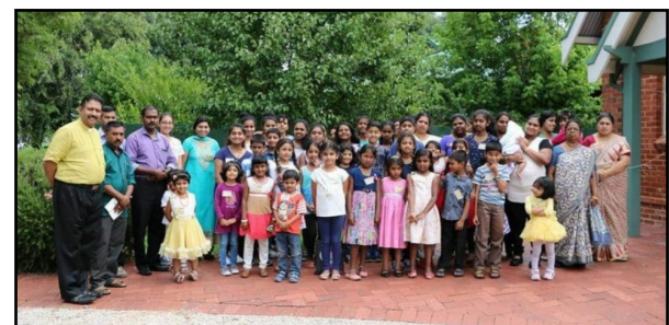
Children who participated in the VBS held in 2017 with the organisers