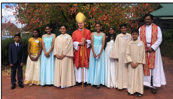
Children who were confirmed pose for a photo with Archbishop Geoffrey Smith