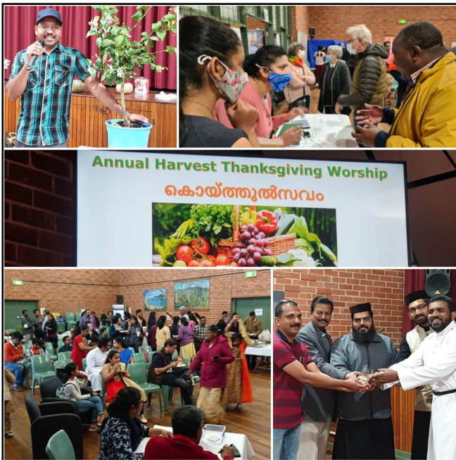
Harvest Festival brings excitement to welcome our friends. This is our major fundraising event.