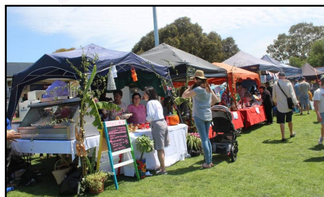
CSI Cong Stall at the Prospect Spring Fair