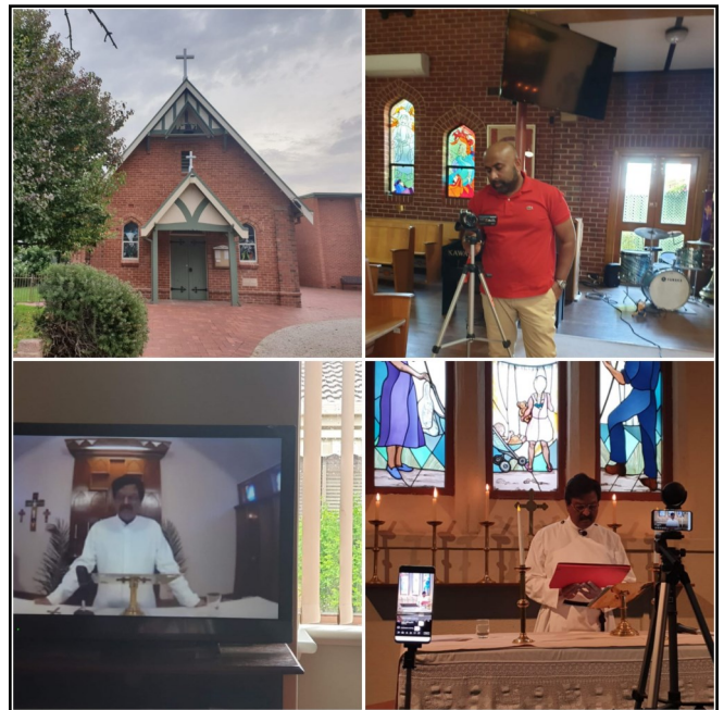
The Covid pandemic saw us going to lockdown, but worship services were regularly streamlined through online platforms.