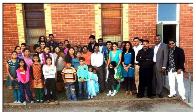
Members present at the first worship held at Uniting Church, Woodville Gardens in May 2012