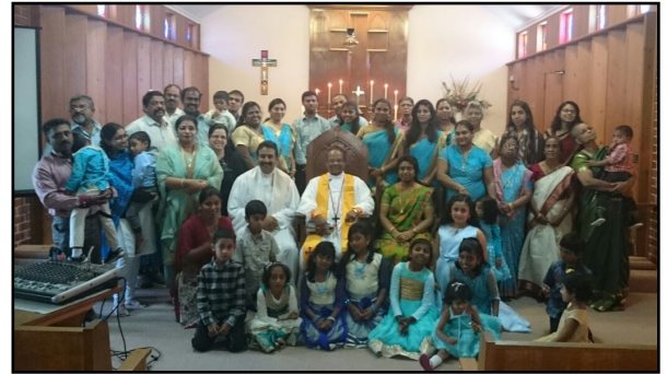
Episcopal visit during the Passion week 2017, Bishop Dharmaraj Rasalam from South Kerala Diocese

These representatives bring the concerns of the Congregation to the Parish Council and, along with the representatives of St Philip's and St Clement's, make the decisions for the Parish.