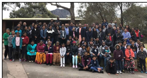
Above: Participation in All Australia CSI Family Conference held at Grampians in September 2018