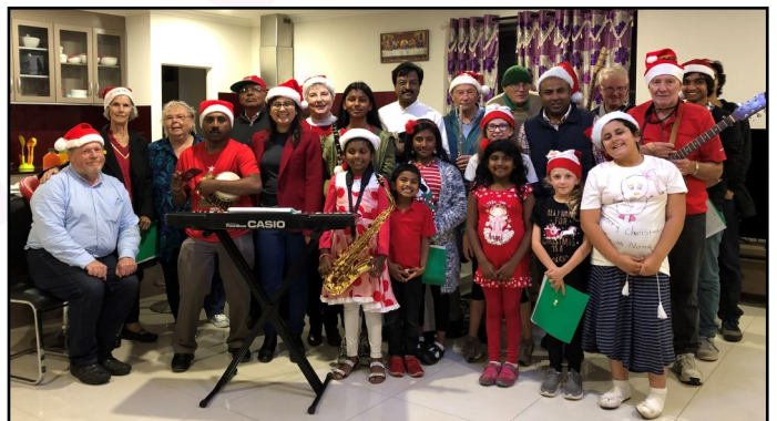
Left: Blend of professional and amateur musicians in the Christmas band